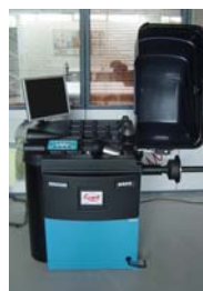
Wheel balancing machine