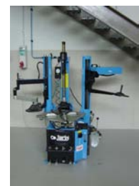
Wheel changing machine