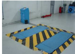
Flat car lift