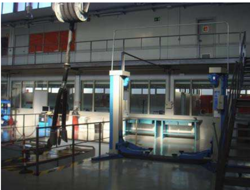
Vehicle preparation area